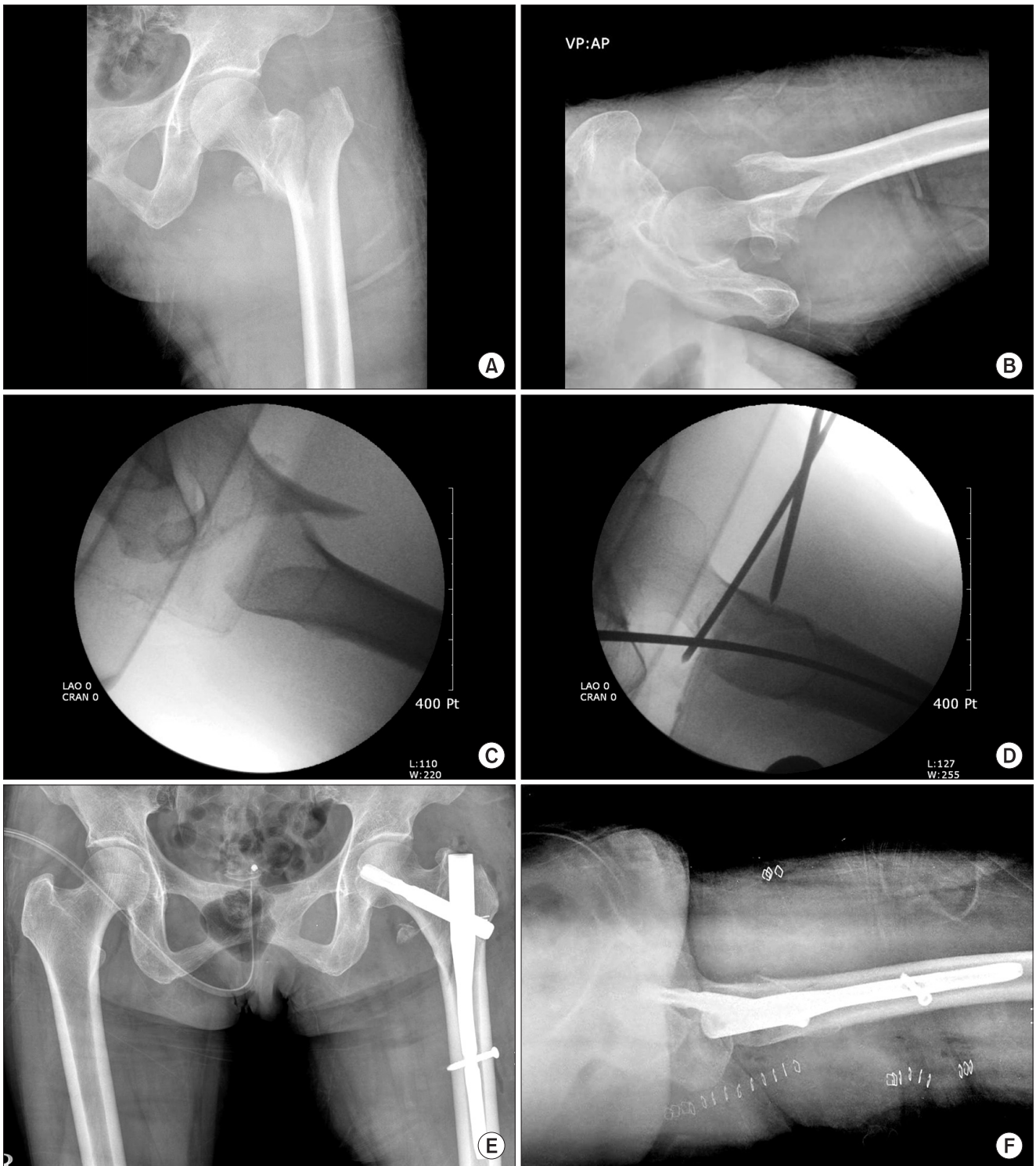
Fig. 4. Anteroposterior (AP; A) and lateral (B) radiographs of a 66-year-old patient showing an unstable fracture pattern. The proximal fragment was fixed in external rotation and simple traction worsened the fracture geometry (C). The fracture could be reduced and the reduction was maintained with the two-pin technique during the insertion of nail device (D). Successful reduction and stable fixation was confirmed in postoperative AP (E) and cross-table lateral (F) radiographs.