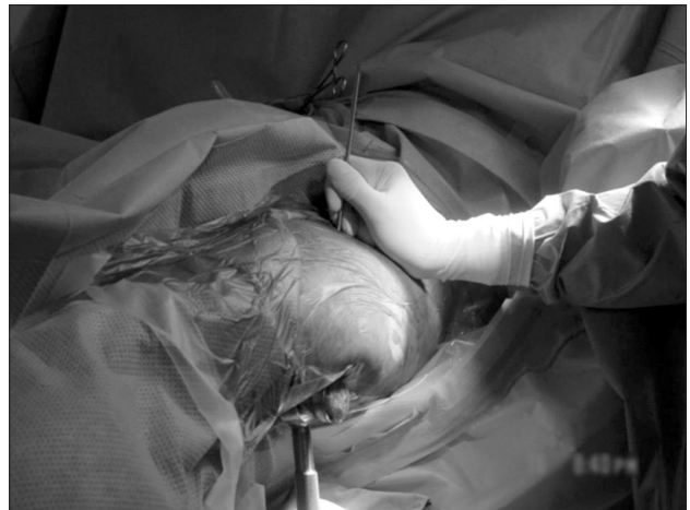
Fig. 2. Photograph of the caudal side of the patient in the cephalad direction. Surgery was performed on the patient's left intertrochanteric fracture. Note the mallet was held to elevate the thigh and the Steinmann pin was controlled by an operator to obtain acceptable reduction in the lateral fluoroscopic view.

When this fracture pattern was noticed during an initial effort at reduction under fluoroscopic guidance, an attempt was tried to obtain rotational alignment only regardless of the displacement on the other plane. If satisfactory rotational alignment was obtained, the patient was prepared and draped. Surgery was performed by an operator and one assistant. The assistant elevated the patient's