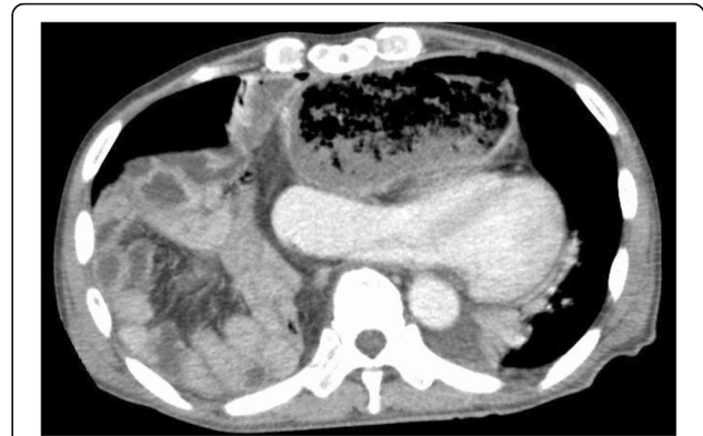
Fig. 1 Computed tomography findings of case 1. The axial image demonstrated that the intestine had been drawn into both thoracic cavities. The intestine pressed the gastric conduit, leading to obstruction and dilation. This dilated gastric conduit severely pressed the heart

The second case involved a 60-year-old man with thoracic esophageal cancer who underwent the same operation as in the first case. He developed sudden