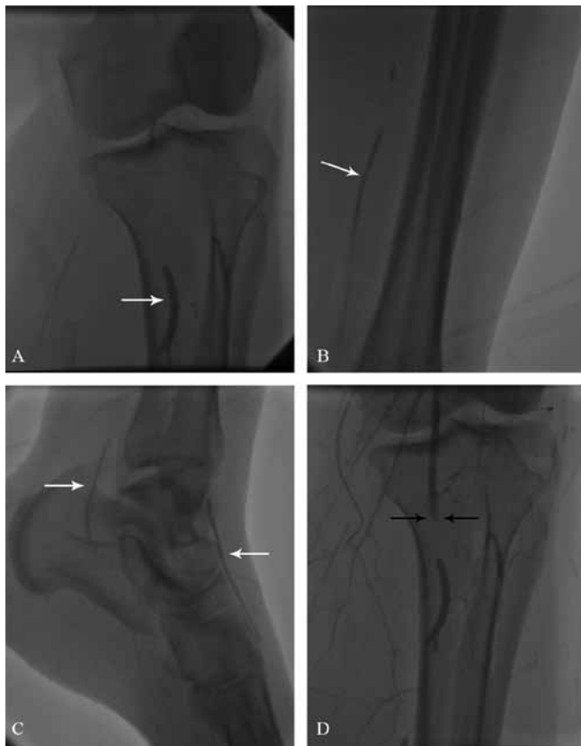
Figure 2. Angiogram before contrast medium injection, showing scattered opacity (cement) in the popliteal fossa (A), leg (B), and foot (C) on the left side (white arrows). After the injection of the contrast medium (D), no blood flow was observed from the popliteal fossa distally with an abrupt occlusion of the popliteal artery (black arrows)

After discussing the case with the vascular consultant, since there were diffuse and long vessel involvements and there were no distal targets for by-pass vascular surgery, we opted for transluminal angioplasty (PTA) of the infrapopliteal arteries. We used the crossover approach via the contralateral common femoral artery to access the infrapopliteal arteries. Multilevel intervention was performed through a long 6-F Shuttle sheath (Cook Medical), and total occlusions were traversed with 0.014-inch hydrophilic wires (Shinobi, Cordis, Miami, Florida).