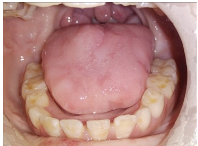
Figure 7: Showing total regression of tongue lesion after 1 month