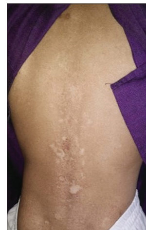
Figure 3: Showing similar skin lesions on back and buttocks

On hard tissue examination, no any abnormality was noted in teeth or any hard tissue.