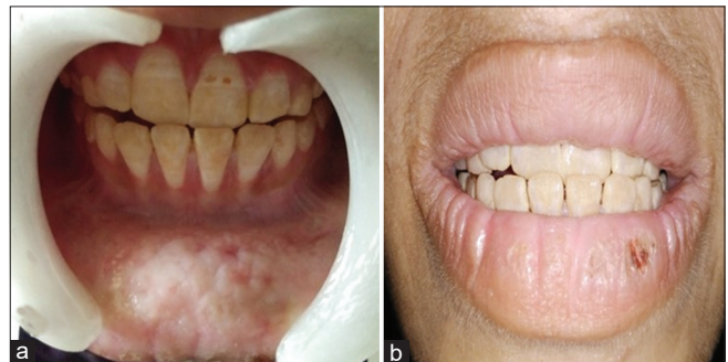
Figure 5: (a) Showing Thickened lower labial mucosa with minute depressions and elevation giving pebbled appearance. (b) Showing crusting and fissuring seen on both lips

As per literature, LP is more prevalent in Sweden, South Africa, and Asia. Consanguineous marriage plays a major role in correlation with LP. [6,7,13] As Indian cases are much less reported and reviewed. Hence, review of 51 cases of LP reported in India from 1969 to 2021 is done along with the present case [Table 1a-c]. [1,4,5,6,8-44] LP is more reported in patients in the age group of 11-20 (51%). More prevalence of LP is reported in males (70.6%). Consanguineous marriage history is positive in 21 (41.2%) of the cases. Siblings are not much affected except in 11 (21.6%) cases.