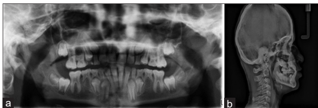
Figure 6: (a) Orthopantomogram showing absence of all 2 nd premolars. Erupting all canine and 1 st premolars and 2 nd molars, and erupted left maxillary 1 st premolar with normal teeth structure. (b) Lateral cephalogram showing bean-shaped calcification in suprasellar region

Follow-up after 1 month, showed that lesions were totally subsided on the tongue as well as tongue movements were also increased up to certain limit. Extremities' lesions were improved as well. Facial and ocular features were unchanged [Figure 7]. The patient was kept on follow-up and recalled after 1 month.