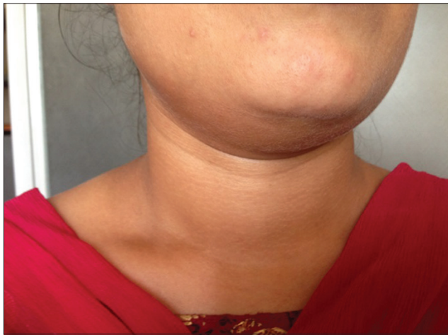
Figure 1: Firm Organisation Organization Grade 2 goitre

Thyroxin suppression testing was done which showed poor suppression of TSH (3.29 \mu IU/L), confirming the diagnosis of thyroid hormone resistance.