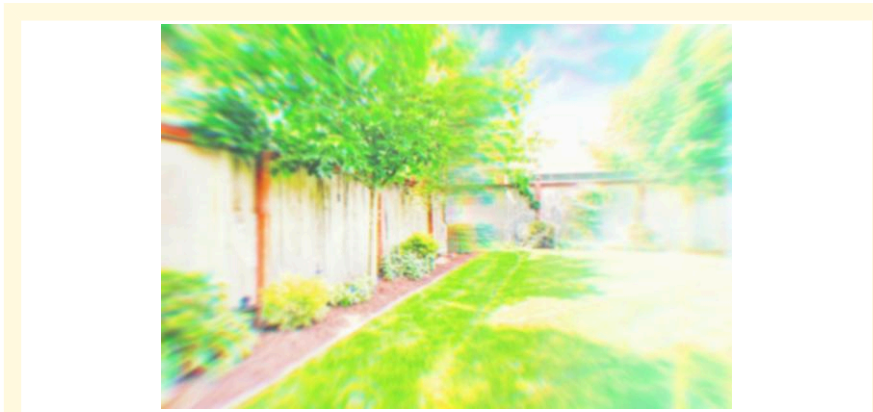
Figure 1 Illustrative image of visual snow syndrome. Illustrative image provided by a person with visual snow syndrome and visual migraine aura, reproduced with permission.