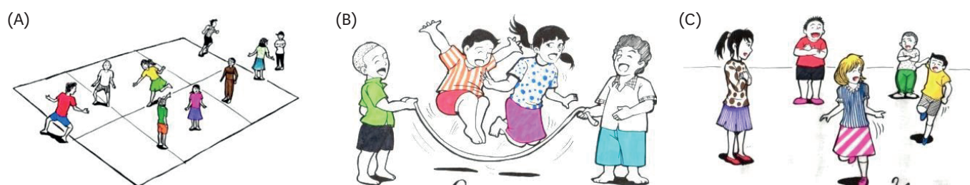
Fig. 1. Galasin (A), sapintrong/luncat tinggi (B) and ucing kup (C) games.