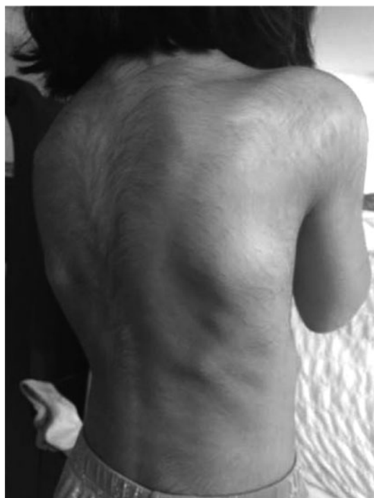
Figure 1. A flare-up with swelling of the back of a young girl diagnosed with FOP. Image is reproduced with the written consent of the patient and her parents. FOP, fibrodysplasia ossificans progressiva.

Given the nature of this mutation and the importance of the ALK2 receptor in homeostasis and development of the skeletal system, pharmaceutical interference with the receptor can be expected to cause numerous potential side effects. Demonstrating the effect of intervention with these drugs in clinical studies has already appeared to be more difficult than initially expected in terms of acceptable risks, expected benefits, and lack of comprehensive understanding of the natural history of the disease. Clinical trials are currently being conducted to further evaluate the safety and efficacy of the aforementioned drugs. However, at the time of this article, no efficacy and safety data have