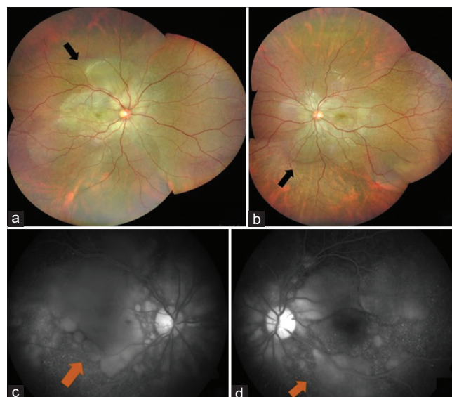
Figure 1: Fundus photo and fluorescein angiography at initial presentation. Montage of right eye (a) and left eye (b) showing multiple SRF pockets at the posterior pole (black arrow); Right eye (c) and left eye (d) FFA showing disc staining and late pooling of the dye (orange arrow) at posterior pole

She was infected with COVID-19 3 weeks before, confirmed with a positive reverse transcriptase-polymerase chain