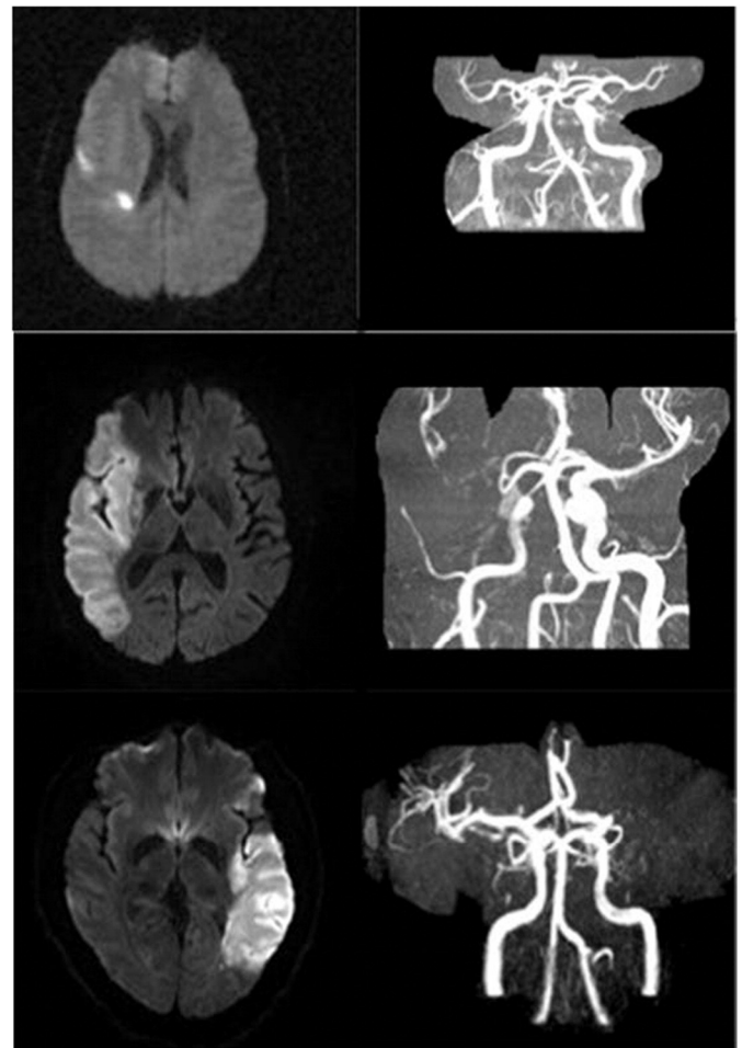
Fig. 1. Top panel. Infarct not involving the insula with patent MCA. Lower panel. Strokes involving the insula with MCA occlusion.

to the insula (large MCA volume strokes) and persistent deficits in mobility and other known risk factors for HAP. Patients with and without HAP in that study were matched for NIHSS scores, but there was a significantly greater percentage of left hemisphere strokes among those without HAP; the equivalent NIHSS score is associated with smaller volume of lesion in left hemisphere compared to right hemisphere stroke (Fink et al., 2002; Gottesman et al., 2009; Menezes et al., 2007; Woo et al., 1999). This bias can account for the fact that only the right insula (included in the largest strokes) was associated with HAP. Insular