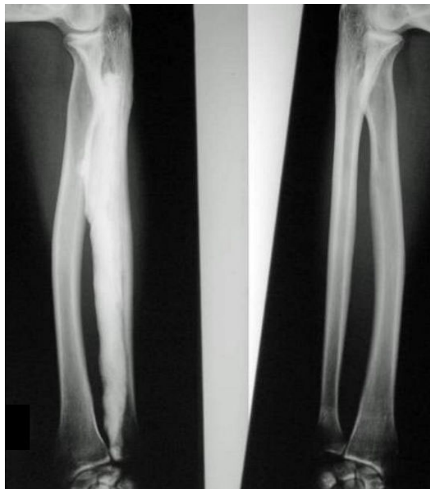
Figure 2 Radiograph of the forearms showed, typical cortical thickening, mostly along the right radius, massive extensive thickening and sclerosis extends along the carpal bones respectively. There was mild sclerosis of the ulnae with bowing; similarly the radius on the left side is also mildly sclerotic.

Blood biochemistry revealed moderate hypercholesterolæmia, and the triglycerides showed mild elevated levels. Serum calcium, phosphorus, and alkaline phosphatase levels were normal. Endocrinological examination of the thyroid hormones, PTH, and adrenocorticotrophic hormones showed no abnormalities. Our patient underwent a genetic investigation of the LEMD3-gene; Genomic DNA was extracted from the whole blood samples and polymerase chain reaction (PCR) was performed to amplify the 13 exons and flanking intronic regions of the LEMD3-Gene (primer sequences are available on request). The PCR products were analysed by direct sequencing (MWG Biotech G, Ebersberg, Germany). We were unable to detect any mutations in the 13 exons and flanking intronic regions of the LEMD3-gene in our patient (NCBI reference sequence: NC-000012).