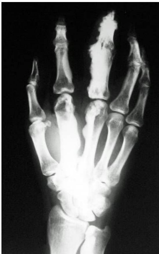
Figure 3 There is massive sclerosis over the second and third digits (carpo-metacarpo-phalangeal). The sclerosis extends to involve the distal and middle phalanges of 4th digit as well as the carpal bones.