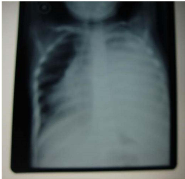
Figure 3 The plain X-ray of the patient's chest showed pleural effusion.

At the NL Hospital, laboratory investigations were as follows: Hands and feet X-rays showed decreased joint space with periarticular erosions and subluxation correlated with the signs of tuberculous arthritis. The chest CT scanner showed pleural effusion. QuantiFERON-TB test was positive (++) . The histopathological examination revealed epithelioid granuloma, which indicates tuberculosis. Serum CRP increased to 126 mg/l. Liver and kidney function tests were normal. Abdominal ultrasound showed ascites, hepatomegaly, and splenomegaly.