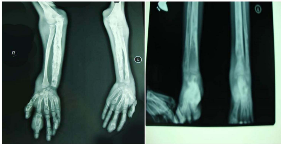
Figure 2 The X-ray images of two upper extremities and lower extremities showed decreased joint space with periarticular erosions and subluxation.