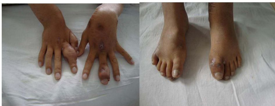
Figure 1 Two views of hands and feet with swelling of metacarpals, metatarsals, and phalanges.

On dermatology examination, there were some skin lesions with fibrinous bases and tuberculous gummas. Because of the clinical characteristics lasting for many years and the laboratory investigations, the patient was diagnosed with Spina Ventosa at a later stage. Eventually, he was transferred to NL Hospital.