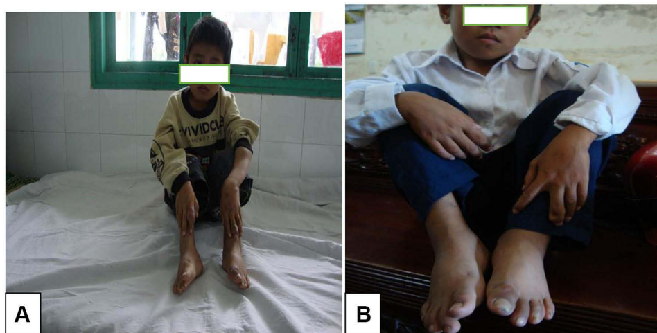
Figure 4 Patient with swelling of both hands and feet before treatment (A) and no swelling in hands and feet, no pleural effusion after successful treatment (B).

In contrast to adults, lesions are located in the peripheral bone among children. 8 Infections usually occur at the metaphysis of the bone, while diaphyseal lesions are uncommon. 9 Sclerosis may progress over time in some cases, but it is not a frequent symptom, except during the healing process. 10 The radiographic feature of the cystic expansion of short tubular bones has led to the name of Spina Ventosa being assigned to tuberculous dactylitis of the short bones of the hand. 11,12 In this patient, sclerosis and thickening of the affected bones indicated a purulent infection. A perplexing image appears as a result of secondary infection of these infected bones.