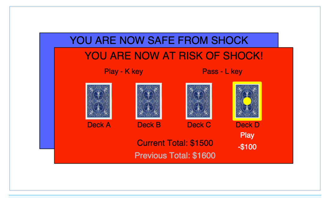
Figure 1 Task schematic. Subjects are given the option to play or pass the deck highlighted in yellow. Outcomes are added or subtracted from the running total displayed at the bottom of the screen. Subjects completed one baseline block whilst safe from shock and one stress block at risk of shock (order counterbalanced).