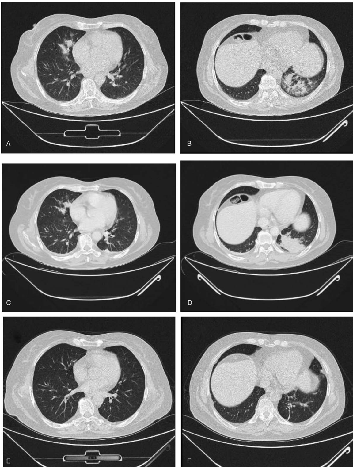
Figure 1. Chest computed tomography (CT) images. CT images at admission showing multiple bilateral patchy infiltrates (A, B). CT images at day 25 showing a large consolidation in the left lower lobe (C, D). Posttreatment (prednisolone) CT images showing alleviation of lesions (E, F).

test and T-SPOT were negative. Autoimmune antibody profile and tumor biomarkers were within normal limits. Chest radiography revealed multiple patchy opacities in the lungs and slightly enlarged mediastinal lymph nodes (Fig. 1A and B).