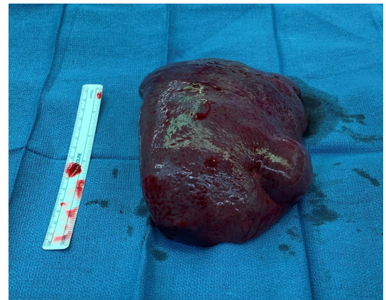
Figure 2 Surgical specimen after laparoscopic hand-assisted splenectomy.

He presented with white blood cell count of 3.1, hemoglobin of 11.5 g/L, and platelet count of 53,000/uL. An fluorodeoxyglucose (FDG)-positron emission tomography (PET) scan was notable only for high metabolic activity in the superior pole of the spleen, concerning for recurrent lymphoma (figure 1). We suspected transformation of CLL into diffuse large B cell lymphoma (DLBCL) (ie, Richter's syndrome) with accompanying paraneoplastic manifestations. On initial evaluation by the surgical team, he was alert and oriented but had expressive aphasia and word-finding difficulties. On re-evaluation in the afternoon, he was not speaking and no