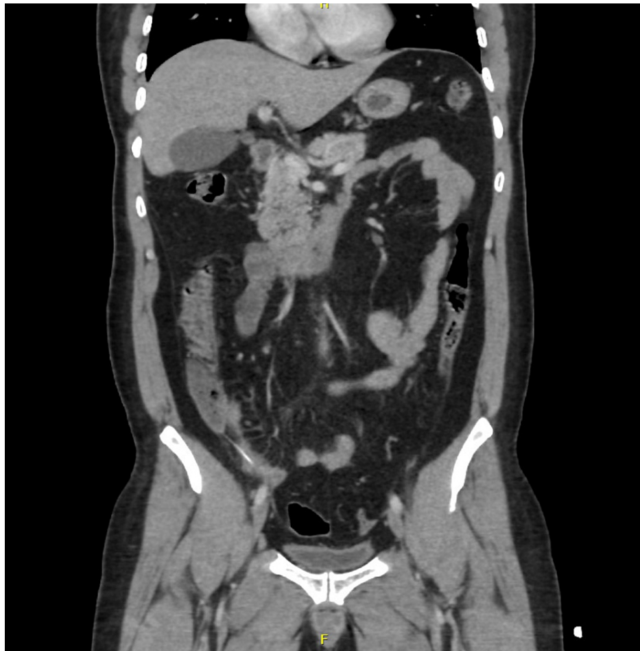
FIGURE 1: Coronal view of the foreign body in the distal ileum.

A laparoscopy was performed on the patient. There was a 7-cm long, pointed foreign body perforating the distal ileum with no spillage of bowel contents. Half of the foreign body (fishbone) was still inside the bowel lumen (Figure 2).