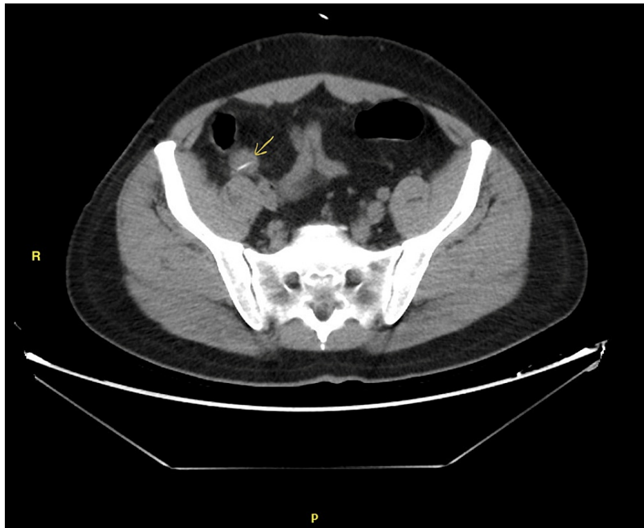
FIGURE 2: Axial view of the foreign body in distal ileum (yellow arrow).

The fish bone was removed, and the perforation was closed with two 3/0 Vicryl Lembert sutures (Figure 3). No drains were placed. The whole procedure was completed laparoscopically. Post-operative recovery was uneventful. After eight hours, the patient was started on clear liquids and discharged the first day postoperatively.