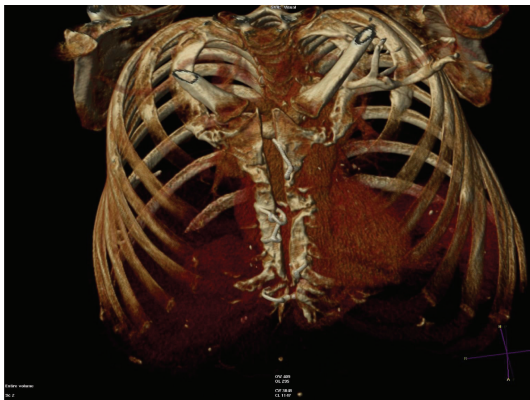
FIGURE 2: CT reconstruction of sternal dehiscence.