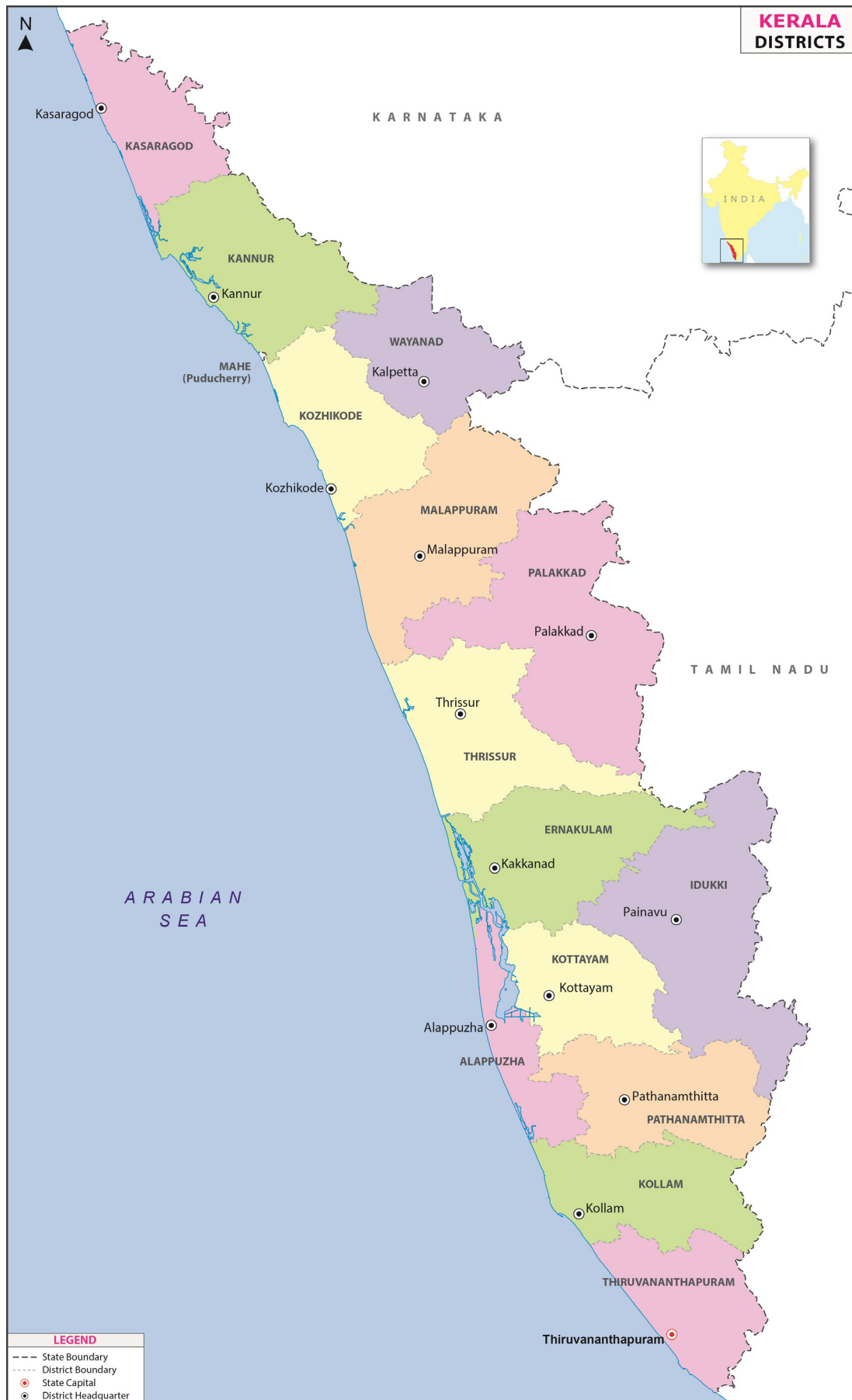
Figure 1 Map of Kerala.