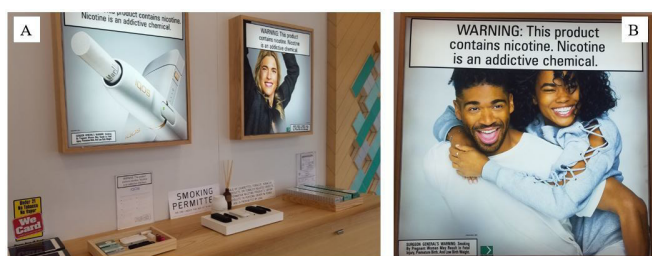
Figure 3 Display and advertisements from inside the IQOS mobile unit (A). Advertisement for IQOS featured inside mobile unit and retail stores (B).

A getiqos.com website was launched by PM USA in August 2019. 2-4 In order to gain access to most parts of this website, a shopper must register for an account, self-certify that they are a current cigarette smoker 21 years old or older (by providing their name, address and driver’s license number), and answer some questions about tobacco use. Then, they must correctly answer questions about themselves (eg, prior addresses and past lenders) to confirm their identity. Once granted access to the password-protected website, the shopper is able to read information about IQOS and watch instructional videos about IQOS, access an IQOS store and retail partner map locator, participate in the refer-a-friend programme, schedule an appointment for a personal IQOS trial or service and support for device issues, learn about and access IQOS care, register an IQOS device and order IQOS products. Through the ‘Shop IQOS’ portal, shoppers (at present, only those with a Georgia street address) can order the IQOS device kit, the individual components of the kit