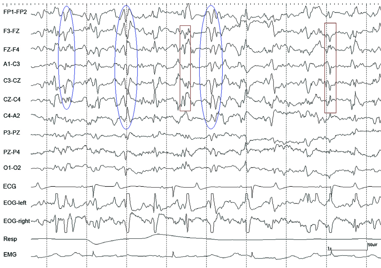
Fig 1. Sharp waves (blue ovals) and spikes (red boxes) in an epoch from horse #2 during isoflurane anesthesia at 1.6 times minimum alveolar concentration with controlled ventilation. Similar discharges are often recorded from epileptic patients. Note: These events were also recorded by the electrooculogram (EOG) channels below. Gain calibration is shown for electroencephalography and EOG tracings only, others vary. The squaring off of some events denotes they are outside the dynamic range of the amplifiers.

Recording duration is a factor in obtaining diagnostic EEG from human epilepsy patients. Even for a recording with a minimum duration of 30 minutes, including hyperventilation and photic stimulation (2 activation techniques used to increase the diagnostic yield [chance of obtaining epileptiform discharges in the EEG]), the odds are roughly 50% that abnormalities will be detected. These odds increase to 85% if a period of