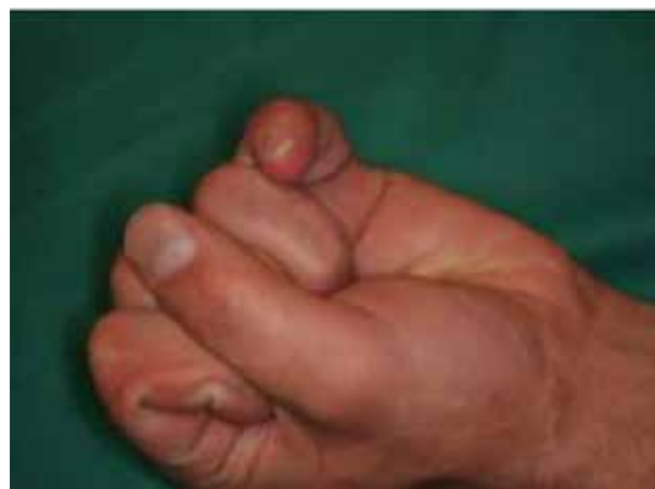
Figure 9. Flexion.

This procedure was used in a bilateral little toe duplication. The medial side duplicated toe was removed and reconstruction was performed. After 8 months, the parents were concerned about the deviation of the operated toe which in their opinion was progressing ( Figure 10 ). DDS was performed by joining the little toe distally to the fourth normal toe. The result at three months was very good and the parents were satisfied.