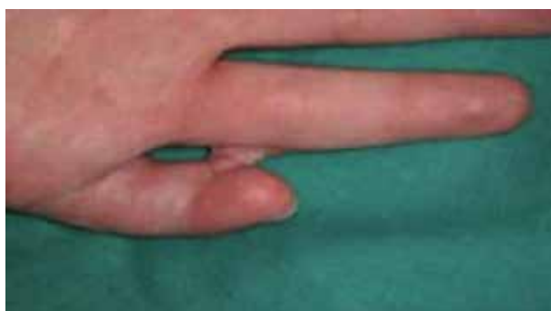
Figure 8. Postoperative result.

This procedure was used in a bilateral little toe duplication. The medial side duplicated toe was removed and reconstruction was performed. After 8 months, the parents were concerned about the deviation of the operated toe which in their opinion was progressing ( Figure 10 ). DDS was performed by joining the little toe distally to the fourth normal toe. The result at three months was very good and the parents were satisfied.