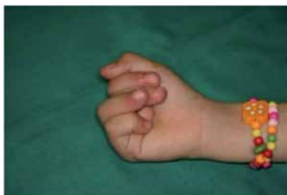
Figure 5. Flexion