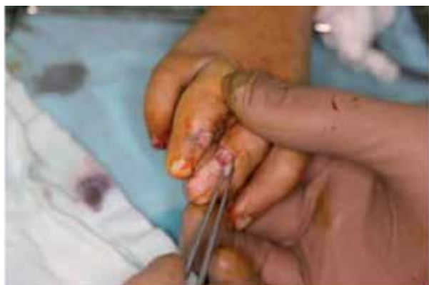
Figure 3. Flaps mobilized.

or joint deformity and helps the operated digit's function by the movements of the normal digit (Figures 5, 6). During the first few postoperative weeks care is taken that this „jointing is not disrupted and after healing a "distal syndactyly" is created which is very durable. It is noteworthy that with time the syndactyly stretches and does not bend the longer finger. During the first two weeks the hygiene of the fingers is a bit difficult to maintain because of fear of disruption of the joining flaps and must be done by the medical personnel; however, after this time hygiene can be easily maintained by cleaning the web via swabs and the parents can themselves do it. We have not observed any maceration of the web space in this group of patients. We use no wires whatsoever to hold the flaps together and usually it takes around two weeks for the flap to heal, during this time the digits should be taped to prevent flap separation.