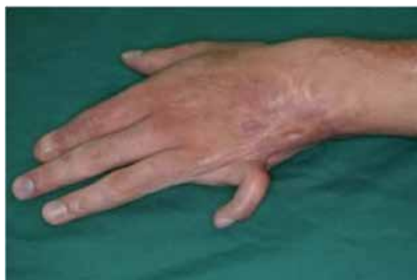
Figure 6. Another patient with contracture of the small finger.