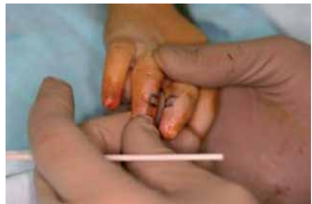
Figure 1. A Typical Case Requiring Treatment

The technique is simple; two rectangular flaps are designed and marked on the adjoining fingers, one being the operated one and the other the normal digit. The flaps are designed in a way that the bases are in opposite planes, i.e., one flap's base is volar and the other flap's base is dorsal ( Figures 1 , 2 ). It is important to hold the fingers straight during the design and marking so that the flaps reach each other at exactly the same level; this prevents the future bending of the longer finger.