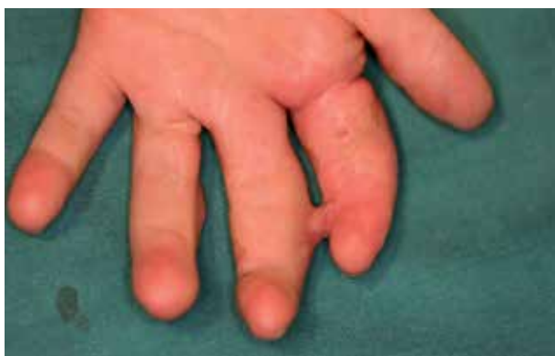
Figure 12. Distal syndactyly (volar aspect).