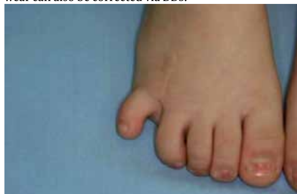
Figure 10. Another patient.

Results of another case are shown in Figures 11 - 12 - 13 . The correction of deformity which may involve the ligaments of the MP joints due to longstanding tight footwear can also be corrected via DDS.