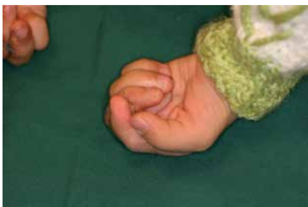
Figure 13. The fingers are flexed and the overriding has been corrected.