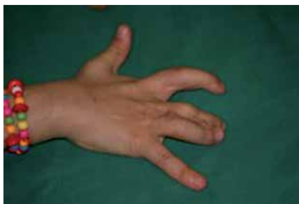
Figure 4. Postoperative result

From 2000 to 2010 in a period of ten years, 11 patients with different diseases of digits in the upper and lower extremities were treated by this technique (Table 1). DDS was applied to the cases of long standing contracture or recurrent surgically corrected deformities (Figure 7).