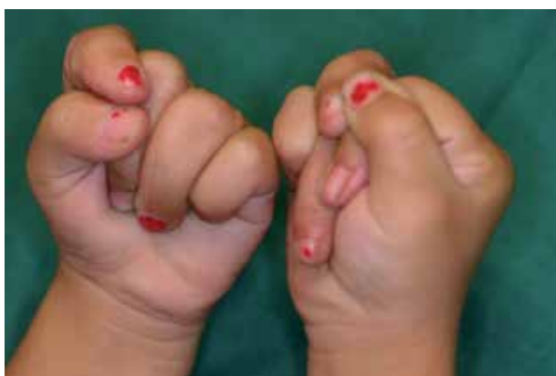
Figure 11. A child with complex syndactyly after the operation and overriding fingers in flexion