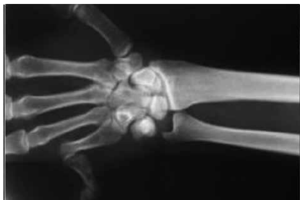
Figure 7. Radiograph of the small finger.