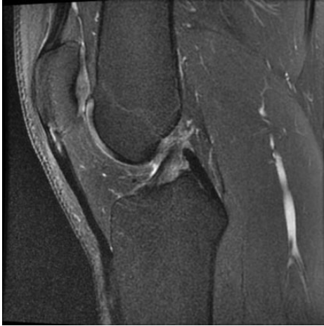
Figure 2. Sagittal magnetic resonance image showing injury on the ventral side of patellar tendon's proximal insertion.

considered for each item and not just the information gathered exclusively from diagnostic images.