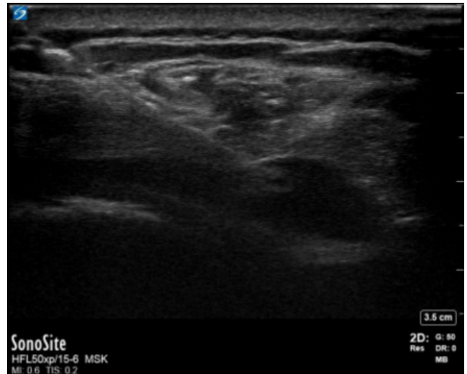
Figure 3 Ultrasound-guided needle aspiration of the right subdeltoid bursa. Position 4 in the Jacobson 5-position shoulder ultrasonography evaluation. The orientation of the probe was rotated 180° compared with figure 2 to facilitate in plane needle guidance.

rheumatologist, nor did he have a subacromial or intra-articular steroid injection.