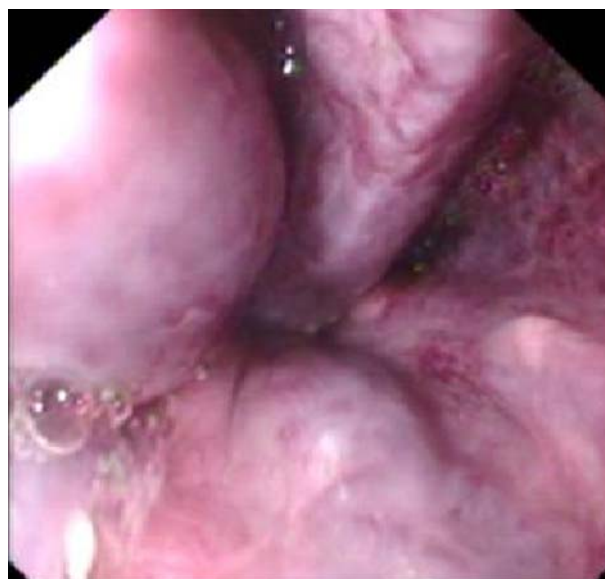
Figure 3 Endoscopic view of large esophageal varices with cherry red spots.

The patient and the baby did not have any complications in the postpartum period. Her ascites was controlled with diuretics. Surveillance endoscopy performed one year following delivery showed small esophageal varices and mild portal gastropathy. The baby was given active and passive immunization against hepatitis B. At the age of 18 months the baby's blood was tested for hepatitis B and C. Serology showed undetectable Anti-HCV antibody and Anti-HDV Ig-G. However, HBsAg was found to be positive with normal ALT and undetectable HBV DNA.