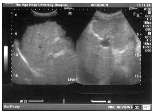
Figure 2 Ultrasound upper abdomen showing coarse liver parenchyma, irregular margins of liver, parahepatic ascities.

showed grade III esophageal varices (Fig 3) and severe portal gastropathy but no gastric varices. Prophylactic banding of esophageal varices was performed on two occasions (at 17 th and 23 rd week of gestation). She was given propranolol 10 mg trice a day and spiranolactone 200 mg daily. She underwent therapeutic paracentesis of massive ascities at 28 th week of gestation. Despite elaborate preparation for a planned vaginal delivery under controlled circumstances, the patient underwent an unanticipated rapid labor and delivered a baby boy at a local facility near her home during the 36 th gestational week.