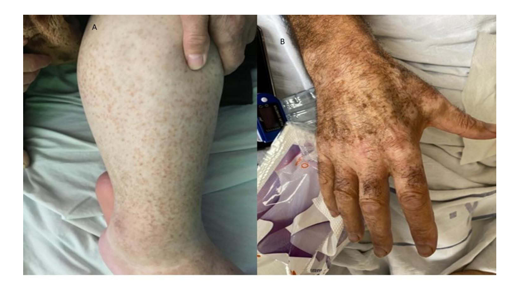
Figure 3 New skin manifestations (A) pigmented purpuric dermatosis (B) vitiligo-like rash.

were more likely to have rashes, although this did not reach statistical significance for loss of smell. Patients who had pruritus were likely to have a skin rash compared to those without pruritus (P=0.001).