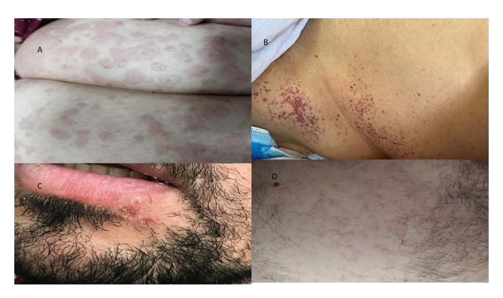
Figure 2 Cutaneous manifestations of COVID-19; (A) erythema multiforme, (B) petechial rash, (C) herpes simplex, (D) urticarial rash.

oral (30.6%), 15.3% had a rash on the head, 1.7% on the neck, 15.3% on the upper limbs, 10.2% on the lower limbs, and 26.9% on the chest or trunk. About 6.8% of patients had a generalized rash. Rashes were asymptomatic in more than onethird of patients (38.6%) and were itching or painful in 61.4% of patients. The duration of the rash varied from 1 to 30 days with a mean (SD) of 7.45 ( \pm 5.5) days.