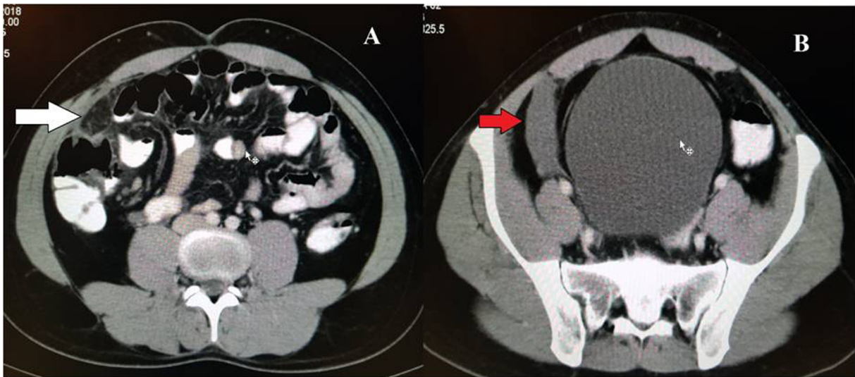
Fig. 1. Contrast enhanced computed tomography showing omental fat stranding (white arrow) and free fluid in the right iliac fossa (red arrow).