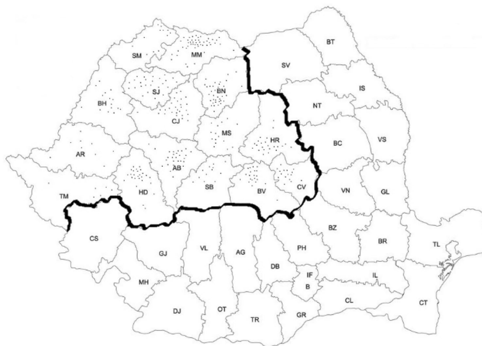
Figure 2. Distribution of identified local varieties of vegetables on the territory of Transylvania, during 2007–2015. The figure created using the Free and Open source QGIS version 3.4.0 ( https://qgis.org/2019 ) 59 .

poorest in traditional vegetable varieties. These areas are devoted to market gardening, and farmers prefer to use the modern varieties of crop plants, to the detriment of local populations. Here, market gardening is practiced in industrial systems and are the main source of income of farmers specialized in vegetable cultivation. Most market gardeners in these areas are not producers of vegetable seed.