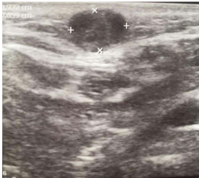
Figure 2 Ovoid, hypoechoic cystic lesion with regular borders, measuring approximately 9.3×6.6 × 9.3 mm in the subcutaneous cellular tissue plane.