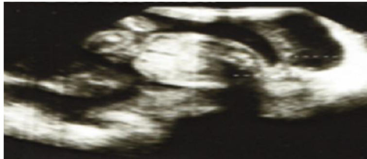
Figure 1 Obstetric ultrasound image showing a pregnancy at 22 weeks of amenorrhea with ascites.

lesion compatible with pulmonary tuberculosis. A diagnostic laparoscopy showed multiple extensive yellow-white nodules on her peritoneal surface with miliary deposits on the intestine (Figure 2), and the biopsy demonstrated caseous necrotic granuloma (Figure 3). She was prescribed antituberculous chemotherapy with rifampicin, isoniazid, and pyrazinamide for 2 months and 4 months of rifampicin-isoniazid. She was given pyridoxine supplementation (25mg/day). After 4 days her general condition improved significantly and her pregnancy continued without any problem. At term a spontaneous vaginal delivery occurred of a live healthy male neonate weighing 3100g. Treatment was well tolerated during pregnancy and after delivery we saw no adverse effects of antituberculous therapy in either the mother or the neonate.