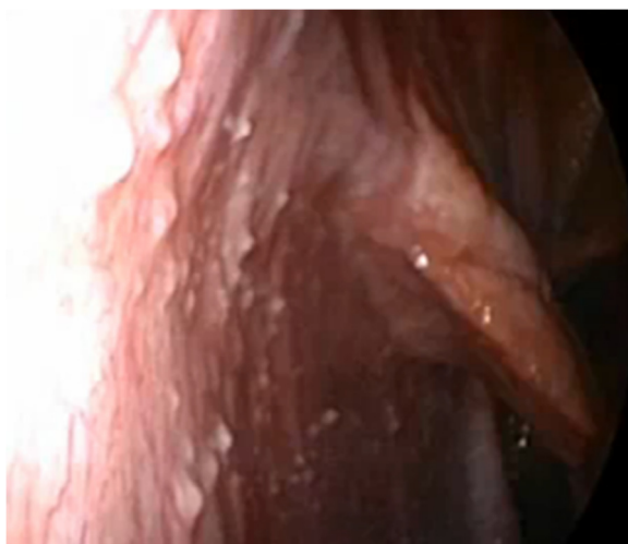
Figure 2 A peritoneal laparoscopy showing multiple extensive yellow-white nodules on the peritoneal surface.