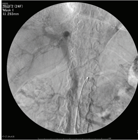
FIGURE 3: Superior mesenteric arterial portogram after TJO shows hepatopetal portal blood flow.

for varices is occasionally used for acute variceal hemorrhage; however, it has the risk of intraperitoneal bleeding and is invasive. Minilaparotomy is necessary for TIO. Therefore, we chose RTO in the present case.