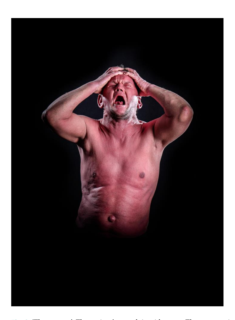
Fig. 3. 'The scream'. The patient's mouth is wide open. The eye area is contracted, with folds at the glabella. The arms are raised and the hands cover the forehead and ears. The skin is erythrodermic and scaled. Expressed emotions: the patient is anxious and upset. He says he would like to jump out of his skin and express his desperation in a loud voice – which, in fact, he did.

\ \ \, \mathbb{C} 2016 The Author(s). Published by S. Karger AG, Basel www.karger.com/cde