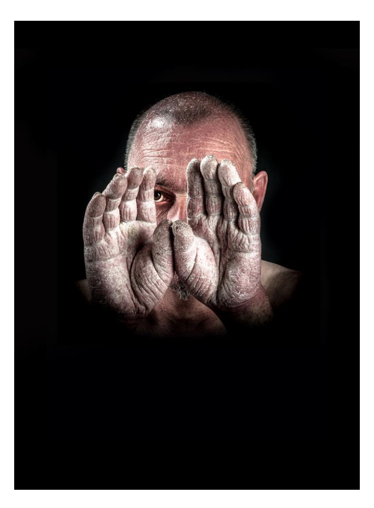
Fig. 6. 'Anxiety'. The patient holds both hands in front of his head, showing his palms, expressing a defensive attitude, protecting his face from the camera, and leaving just one eye to look through. The palms of his erythematous hands are covered with thick white scales and show deep and prominent skin folds. The parietal area of the head is red and covered with scales. Expressed emotions: on communicating with the patient, we find that he is reserved, anxious, and slow in opening up with others and coming to terms with the situation. He is told that the purpose of taking the picture is not to present him as a dermatologic exhibit but to draw attention to the debilitating effect of the skin disease and his personal plight. The patient feels isolated and does not wish to be seen in the public as an unusual human specimen. He is able to relieve his concerns by communicating about his anxiety.

\ \ \, \ \ \, \ \ \, \ \, \ \, \ \ \, \ \ \, \ \ \, \ \ \, \ \ \, \ \ \, \ \ \, \ \ \, \ \ \, \ \ \, \ \ \, \ \ \, \ \ \, \ \ \, \ \ \, \ \ \, \ \ \, \ \ \, \ \ \, \ \ \, \ \ \, \ \ \ \ \, \ \ \, \ \ \ \ \ \ \ \ \ \ \ \ \ \ \ \ \ \ \ \ \ \ \ \ \ \ \ \ \ \ \ \ \ \ \ \ \ \ \ \ \ \ \ \ \ \ \ \ \ \ \ \ \ \ \ \ \ \ \ \ \ \ \ \ \ \ \ \ \ \ \ \ \ \ \ \ \ \ \ \ \ \ \ \ \ \ \ \ \ \ \ \ \ \ \ \ \ \ \ \ \ \ \ \ \ \ \ \ \ \ \ \ \ \ \ \ \ \ \ \ \ \ \ \ \ \ \ \ \ \ \ \ \ \ \ \ \ \ \ \ \ \ \ \ \ \ \ \ \ \ \ \ \ \ \ \ \ \ \ \ \ \ \ \ \ \ \ \ \ \ \ \ \ \ \ \ \ \ \ \ \ \ \ \ \ \ \ \ \ \ \ \ \ \ \ \ \ \ \ \ \ \ \ \ \ \ \ \ \ \ \ \ \ \ \ \ \ \ \ \ \ \ \ \ \ \ \ \ \ \ \ \ \ \ \ \ \ \ \ \ \ \ \ \ \ \ \ \ \ \ \ \ \ \ \ \ \ \ \ \ \ \ \ \ \ \ \ \ \ \ \ \ \ \ \ \ \ \ \ \ \ \ \ \ \ \ \ \ \ \ \ \ \ \ \ \ \ \ \ \ \ \ \ \ \ \ \ \ \ \ \ \ \ \ \ \ \ \ \ \ \ \ \ \ \ \ \ \ \ \ \ \ \ \ \ \ \ \ \ \ \ \ \ \ \ \ \ \ \ \ \ \ \ \ \ \ \