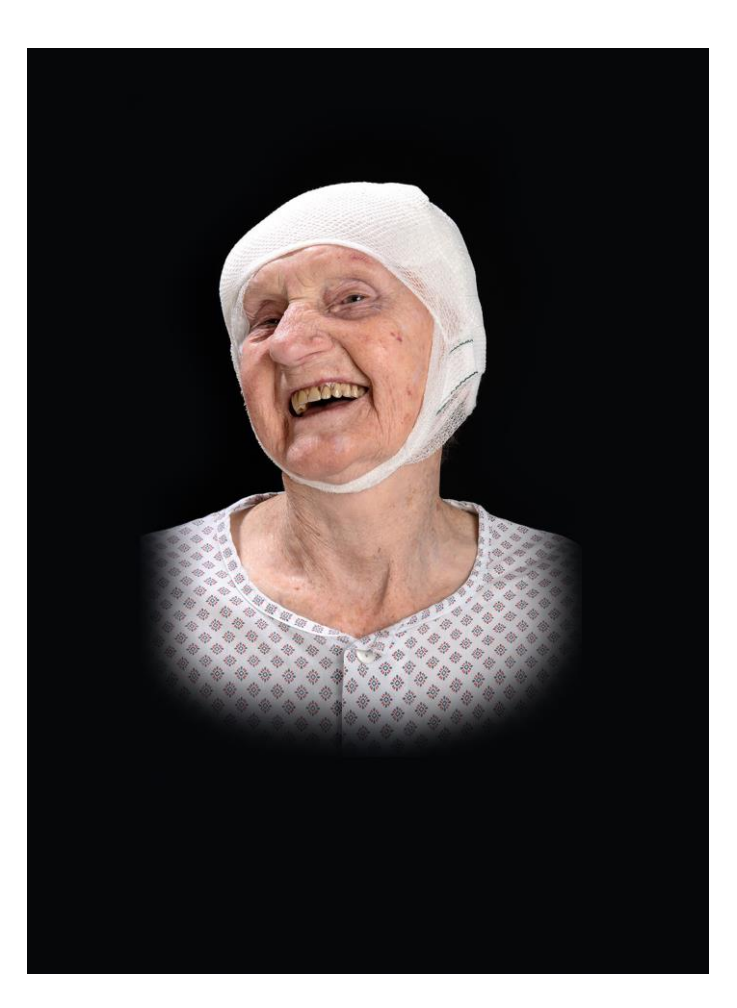
Fig. 5. 'Joie de vivre (joy of life)'. The photograph shows a laughing elderly woman. Her head is covered with a white cap. The remaining visible skin shows signs of aging. Expressed emotions: the patient looks happy and content. She receives attention because of her cap. She has overcome her operation, which was devoid of complications. Being an elderly woman, she finds it easy to be happy.