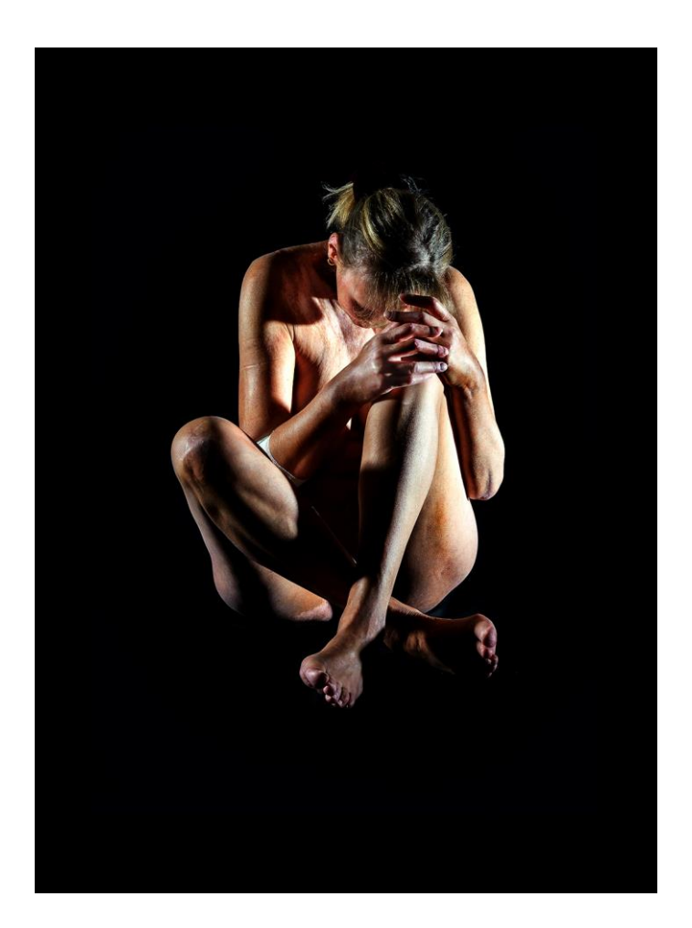
Fig. 2. 'Mourning'. The patient is in a fully cowering position, like an embryo, and hiding her face. The skin appears thickened and indurated; especially the fingers are red and thickened. Expressed emotions: the patient is happy to present her disease on a picture but tries to hide herself because of her hopelessness and despair. She knows her disease is progressing continuously but tries to overcome this by viewing her body in a picture series.