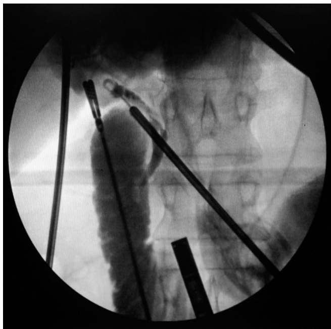
Figure 5. The injected contrast visualized the mucosal valves of the cyst duct.

was in reality the common bile duct, biliary damage would occur, resulting in a Stewart and Way type 1 injury, 4 which requires a delicate repair.