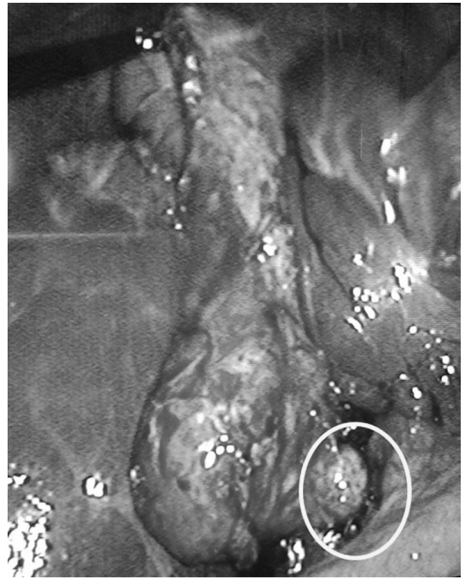
Figure 4. The gallbladder with L shaped configuration tapering down (white circle).

Although the initial high incidence of biliary injury rate associated with laparoscopic cholecystectomy has decreased, it remains higher than that of the open procedure. A rate of 0.5% has been attributed to laparoscopic cholecystectomy, compared to 0.2% of its open counterpart. 2 Moreover, the severity of laparoscopic injuries is usually greater than that of the open technique. 3 The most