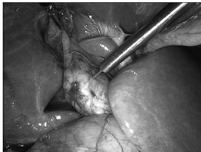
Figure 2. Injection of the contrast into what appeared to be the lower part of the gallbladder.

collection. The common bile duct (CBD) measured 7 mm, and there was a stone in its lower end with dilatation of the intrahepatic biliary radicles. Endoscopic retrograde cholangiopancreatography (ERCP) was attempted, but the presence of a scarred papilla prevented CBD cannulation. In the meantime, the patient desaturated and the procedure was terminated. Reattempted ERCP with the patient under general anaesthesia succeeded to clear the CBD from different-sized stones, and the free drainage of bile was established.