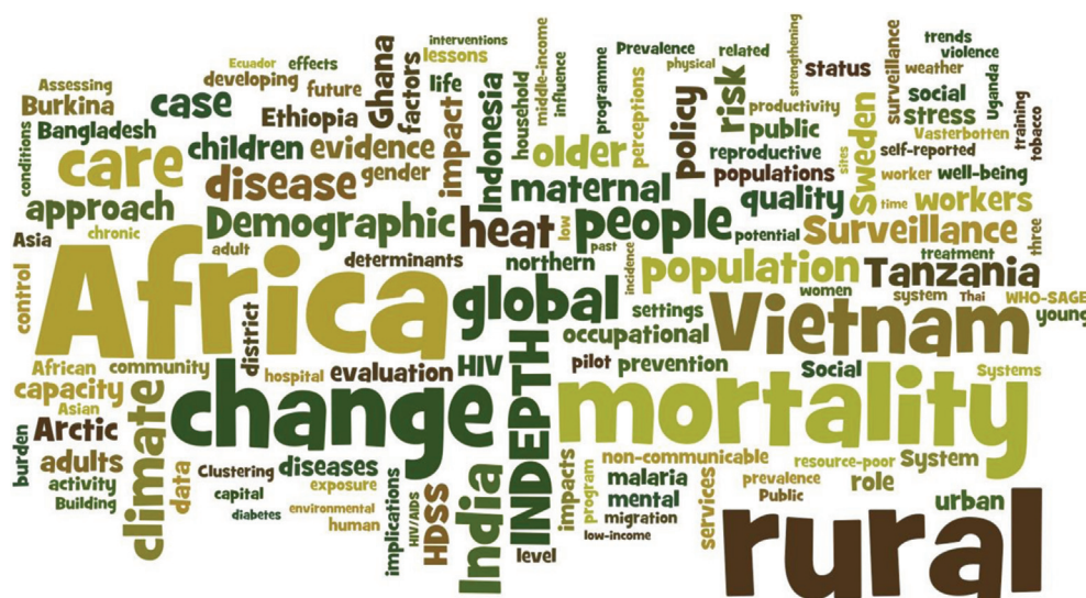
Fig. 2. Word clouds from titles of articles published in Global Health Action 2008–2013. The figure was created in Wordle™ (www.wordle.net).

An example of a PhD review paper is that of Mark Collinsson, based on his PhD thesis “Striving against adversity: the dynamics of migration, health and poverty in rural South Africa” published in 2010 (4) along with a commentary by the opponent Professor Kim Streatfield (5). GHA readers can also download a PowerPoint file from the field site Agincourt in South Africa, as well as a video showing the public defence on 15 May 2009, from the GHA website.