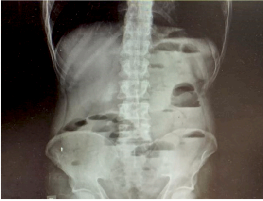
Fig. 1. Up-right abdominal X-ray revealing air-fluid level.