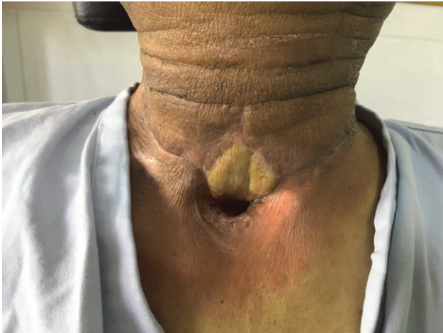
Fig. 2. Three weeks after the reconstruction, the healing of this distal paddle to the native neck skin was good despite previous neck irradiation.

lar food. Esophagography demonstrated a patent neohypopharynx with no evidence of stricture or fistula (see figure, Supplemental Digital Content 6, http://links.lww.com/PRSGO/A454 ).