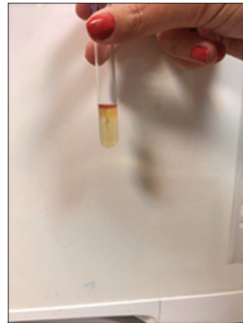
Figure 2: Indol positive gram negative bacilli