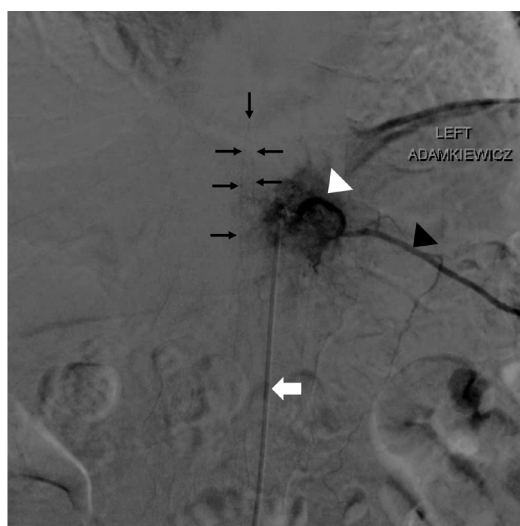
Figure 2 - Microcatheter (white arrow) in the descending aorta, with selective catheterization of the left T11 intercostal artery pedicle showing prominent blush of tumor vasculature (white arrowhead) via multiple small proximal racemose feeders. The artery of Adamkiewicz (black arrows) arises distally and ascends approximately two vertebral levels before making a hairpin turn and descending in the midline. The continuation of the left intercostal artery (black arrowhead) is also noted.

directly from the aorta. As they course posteriorly, the segmental arteries typically give rise to vessels supplying the vertebral bodies and bones of the spine (via the pretransverse/paravertebral arterial system); the rib cage (via the intercostal arteries); and the neural elements, including bony and soft tissue posterior to the transverse processes (via the dorsal spinal arteries).