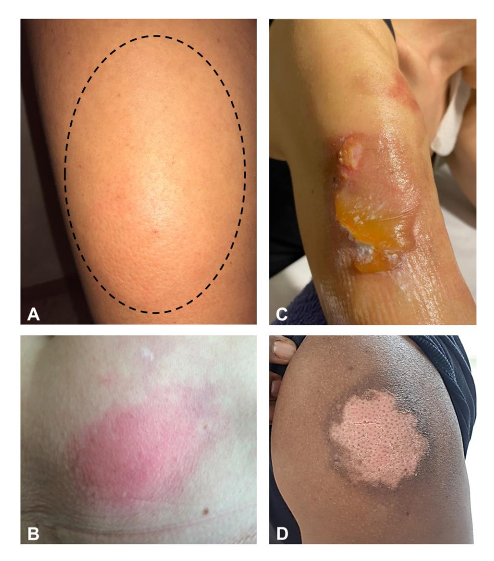
Figure 2. Edematous ( A ) and erythematous ( B ) indurated and tender plaques in the site of the injection developed one week after BNT162b2 vaccination in 36- and 67-year-old females, respectively. Burning bullous reactions on the deltoid area after the application of an ice pack to relieve the pain in a 56-year-old woman ( C ). Depigmented erythematous plaque of the deltoid skin developed in a 39-year-old African man three weeks after BNT162b2 vaccination ( D ).

eschars surrounded by indurated erythematous borders at site of inoculation were reported one week after BNT162b2 vaccination [13]. The mean time to onset ranges from 4 to 11 days from the first [7,8,14] and 2–5 days from the second dose [7]. The COVID arm can recur with the booster but is, on average, likely to be less severe and may develop faster [7]. In the case of fever, the suspect of cellulitis should be ruled out [12]. Histopathology shows a superficial and deep perivascular lymphocytic infiltrate with dilated vessels, intraluminal neutrophils, and negative immunohistochemistry for the SARS-CoV-2 spike protein, consistent with delayed-type or T-cell-mediated hypersensitivity reactions [12]. Symptomatic therapies as antihistamines and/or topical glucocorticoids can be used for treatment, as for drug-induced injection site reactions [14,15]. No serious adverse reactions have been reported after the second dose. Burning bullous reactions have been observed after the application of an ice pack for a relief from pain (Figure 2C). Pigmentary changes (hyper or hypo) may follow the acute phase, especially after more severe reactions (Figure 2D).