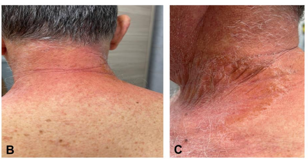
Figure 4. Erythematous and sharply demarcated lesions with symmetric and intertriginous-flexural distribution involving the neck and the gluteal area (symmetrical drug-related intertriginous and flexural exanthema—SDRIFE) developed on a 65-year-old physician two weeks after the BNT162b2 vaccine ( A–C ).