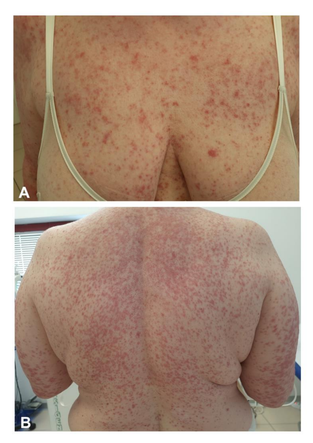
Figure 3. Itchy confluent erythematous maculopapular eruption involving the upper trunk and limbs in a bilateral and symmetrical fashion and typical craniocaudal progression developed five days after the mRNA-1273 vaccine on a 54-year-old woman ( A,B ).