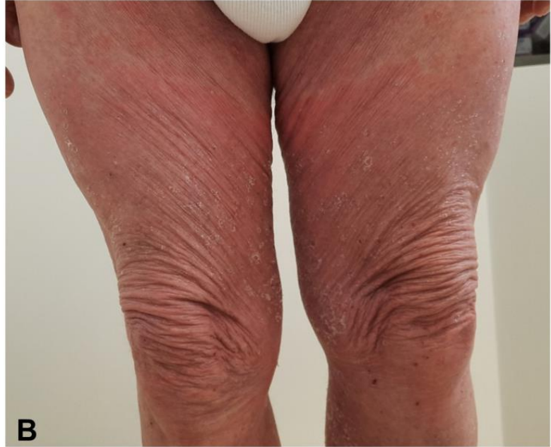
Figure 5. Diffuse bilateral eczematous lesions with overlying excoriation of the back, arms, and legs on a patient without a history of atopic dermatitis following the AZD1222 vaccine (71-year-old man) ( A,B ).