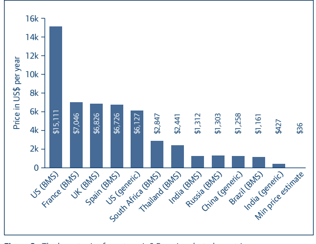
Figure 3. The lowest price for entecavir 0.5 mg in selected countries (per patient per year) (References for individual prices can be found in Appendix 2.)

Hepatitis B infection leads to approximately 686,000 deaths per year. This life-threatening viral infection could be controlled using