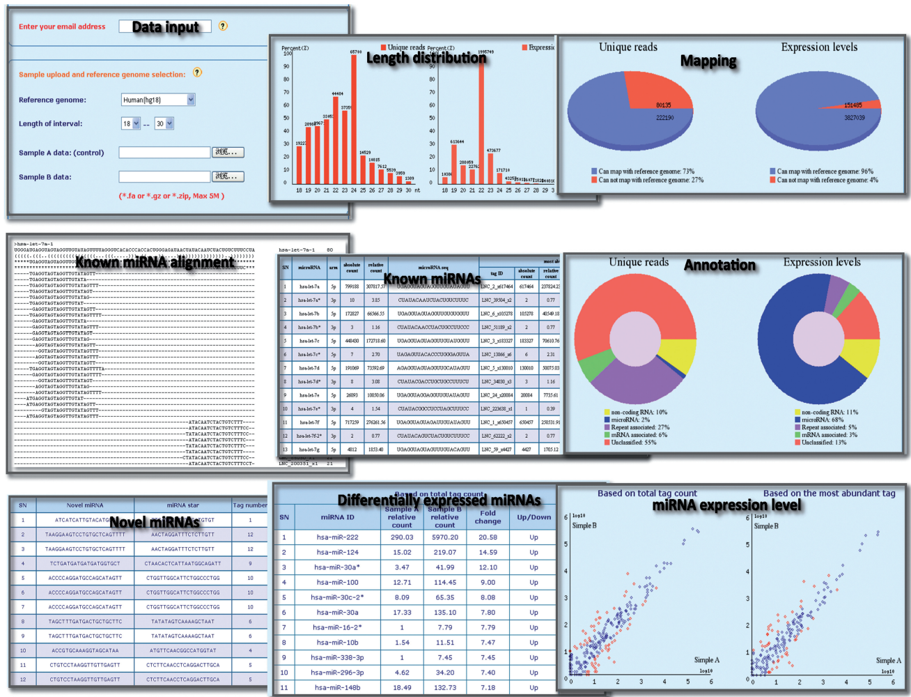
Figure 2. Screenshots of the mirTools web interface.

useful to allow users to easily determine the efficiency of the deep sequencing procedure for miRNA detection and to simultaneously compare length distributions between samples.