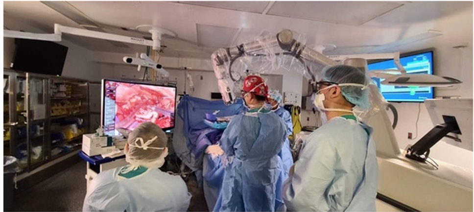
Fig. 2 Photograph depicting left-sided ATL operating room configuration

set up and positioning of the exoscope has not delayed the case as familiarity at our institution has improved.