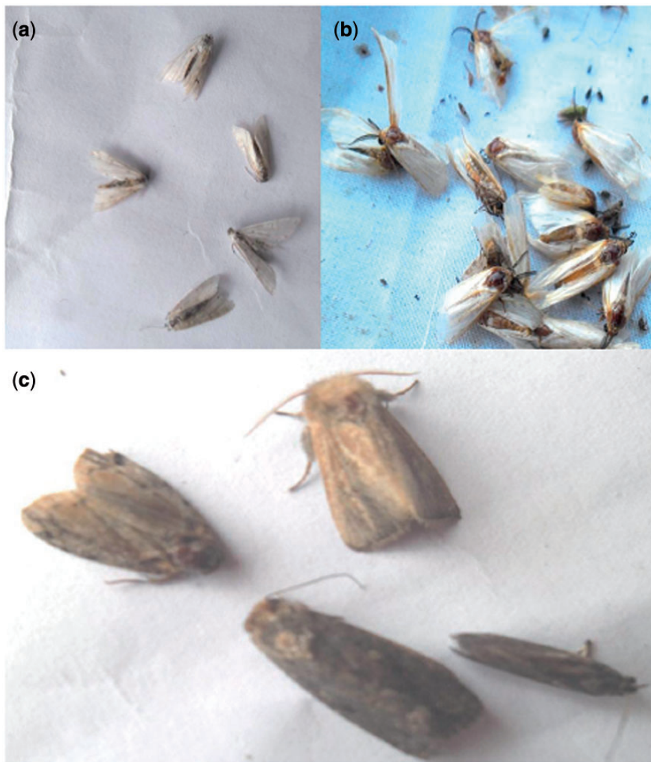
Fig. 1. Lepidopterous stem borers trapped during survey: (a) C. partellus , (b) M. separatella , and (c) S. calamistis .

In all of four study locations, stem borer larvae were more aggregated along the edges of rice fields than in the middle parts (Fig. 2). Among these wards, Chela had the highest number of larvae followed by Ngaya and Kashishi while Bulige had the lowest (Fig. 2).