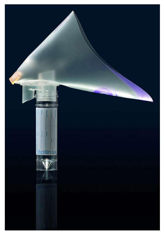
Figure 1 The Peezy device.

the funnel device and hold it against the perineum where marked on the funnel, then 'let the urine flow'. Once completed, the patient unscrewed the upright universal container from the device, discarded the funnel, put a lid on the universal container and returned it to the clinic staff.