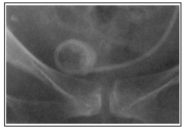
Fig.2: Stent encrustration of bladder coil (radiography aspect).

As regards stent complications like urinary tract infection, encrustration, migration, spontaneous