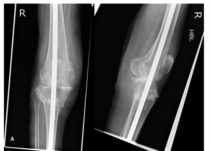
Figure 3: 16-week post-operative radiograph showing good fracture union and no secondary displacement. (a) Anteroposterior view, (b) lateral view.

There are several limitations of this form of treatment. Primarily, as the knee is fixed in 10° flexion until the nail is removed; there is a loss of knee function, necessitating gait retraining, and increased energy requirement.