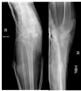
Figure 1: Pre-operative radiographs showing displaced medial tibial plateau fracture. (a) Anteroposterior view, (b) lateral view.