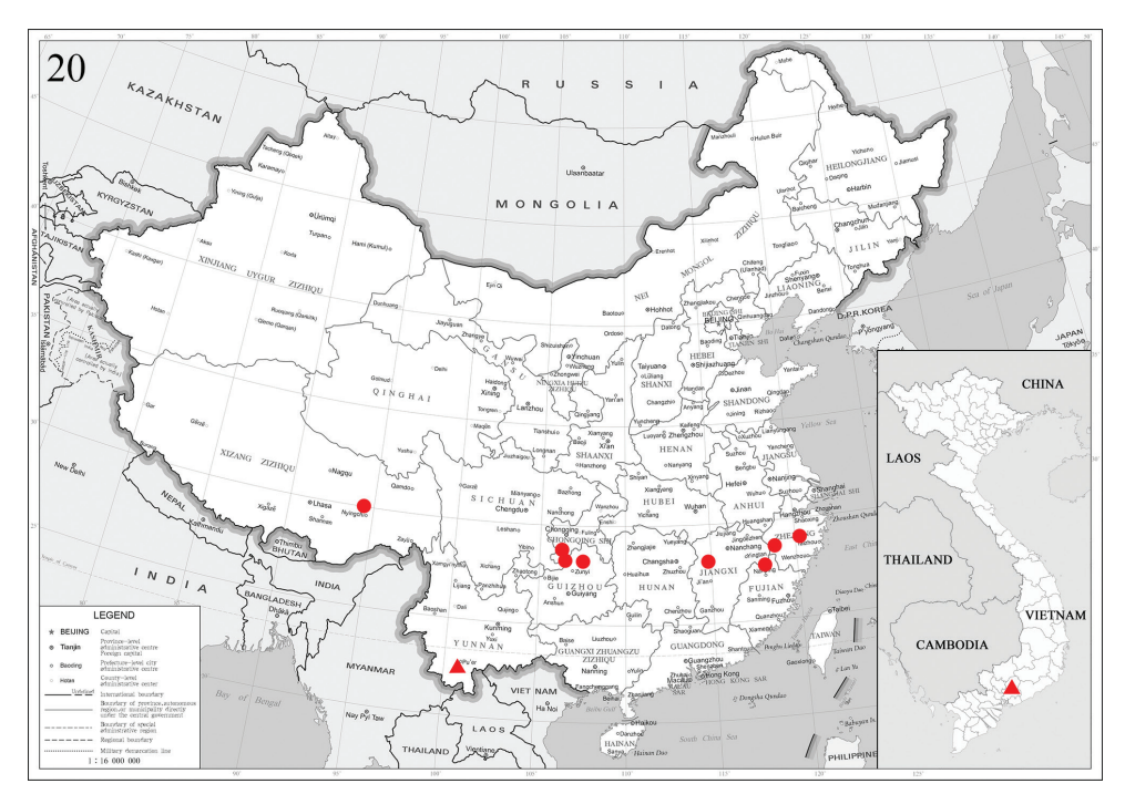
Figure 20. Distribution map of two new species of Pseudidonauton : circle: P. sinensis sp. nov. (China: Chongqing, Zhejiang, Guizhou, Fujian, Jiangxi, Xizang); triangle: P. puera sp. nov. (China: Yunnan; Vietnam: Dong Nai).

Bionomics. The moths fly in late June and August. The Chinese specimens were collected with a light trap close to a coniferous forest; the main vegetation around the collecting site consists of Pinus yunnanensis Franch. (Pinaceae).