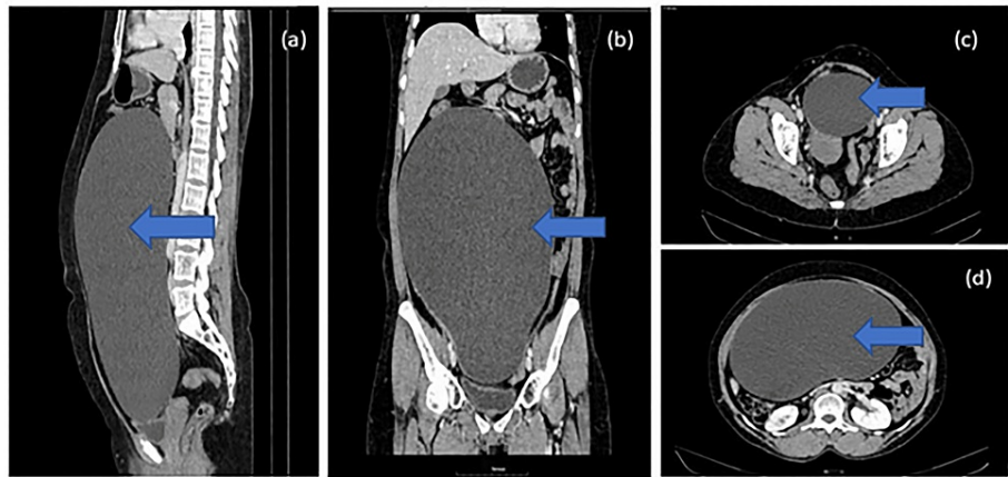
FIGURE 1: Contrast-enhanced CT (CECT) of abdomen and pelvis showing a) sagittal image, b) coronal image, c) transverse image pelvic region, d) transverse image upper abdomen

The patient's serum carcinoembryonic antigen (CEA) was found to be 1.4 ng/ml (0 to 2.5ng/ml) and cancer antigen 125 (CA125) was 12 units/ml (0 to 35 units/ml). Based on clinical and radiological findings with negative tumour marker levels, a benign cystic lesion of the ovary, ovarian cyst, or mesenteric cyst was considered. The patient was posted for exploratory laparotomy for excision of the cyst.