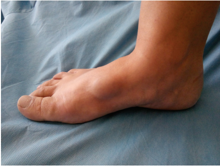
FIGURE 1: Appearance of a venous aneurysm of the medial marginal vein of the foot initially diagnosed as a foot hygroma (patient is in upright position).