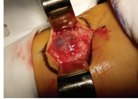
FIGURE 3: Intraoperative aspect of the venous aneurysm before excision.

Histopathological examination of the sac of aneurysm revealed normal but thinned vein wall with reduced number of smooth muscle cells. At one-month follow-up, there were no signs of recurrence and the patient has declared complete satisfaction by outcome of intervention.