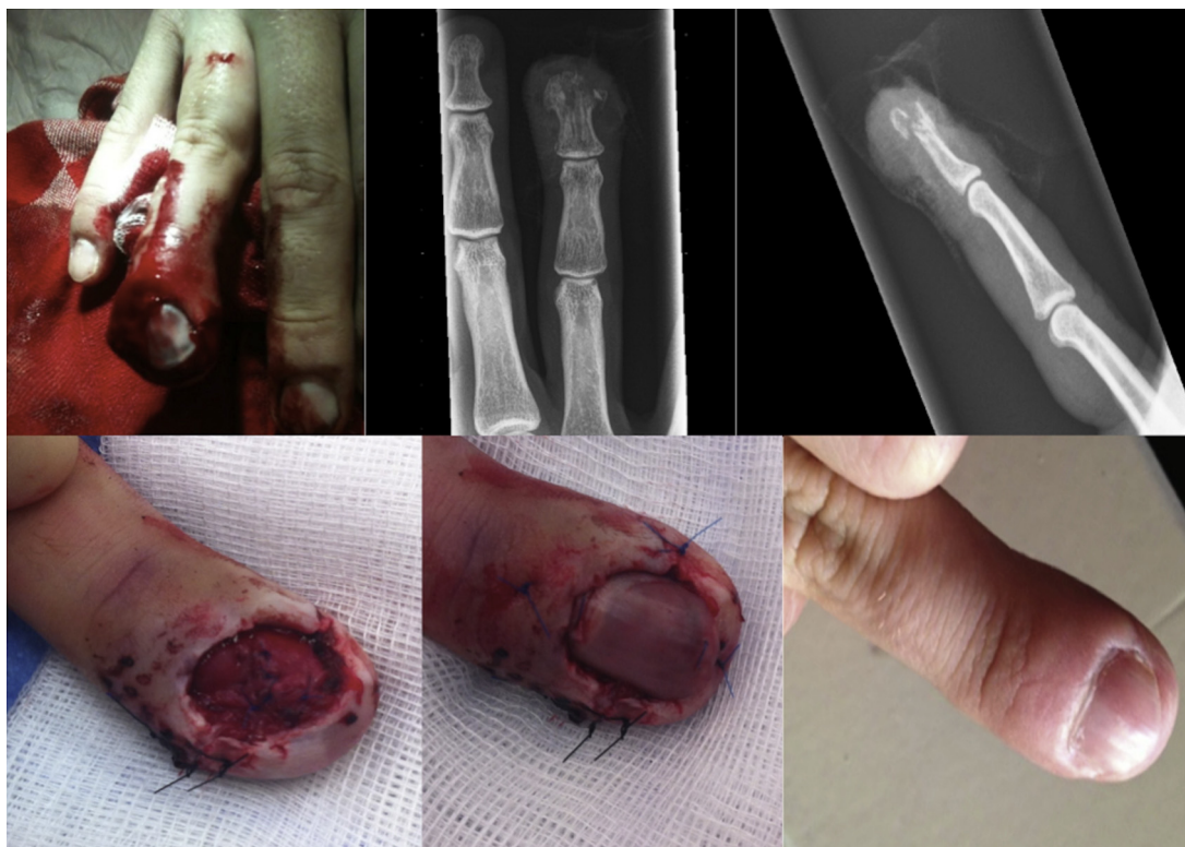
Fig. 1. A = Clinical picture of the initial trauma; B + C = X-ray of the initial trauma; D = peroperative image of the nail bed; E = peroperative image of the nail; F = postoperative image after a 7-month follow-up.

Patients with blunt trauma of the fingertip are mostly encountered by family doctors and emergency physicians [1,3]. Although many injuries require relative simple treatments, nail bed injuries are easily overlooked. If treated inadequately secondary deformities will occur if explained below. It remains difficult to assess the extent of the injury in swollen, painful and bloody fingertips, especially in children as they are less cooperative and less suitable for local anesthetic ring block to aid inspection [6]. Furthermore, an intact nail makes it impossible to assess the damage of the nail bed without removing the nail [6]. In case of nail bed hematomas covering more than 50% of the nail bed without evidence of a fracture and intact nail and nail edges, it is sufficient to evacuate the hematoma through a cauterized hole and leave the nail in place. However, bear in mind that nail bed lacerations may be present in this clinical situation the resulting scar tissue of an unrepaired nail bed laceration can cause deformity and make the patient prone to repetitive infections. The nail plate should be removed in the pres-