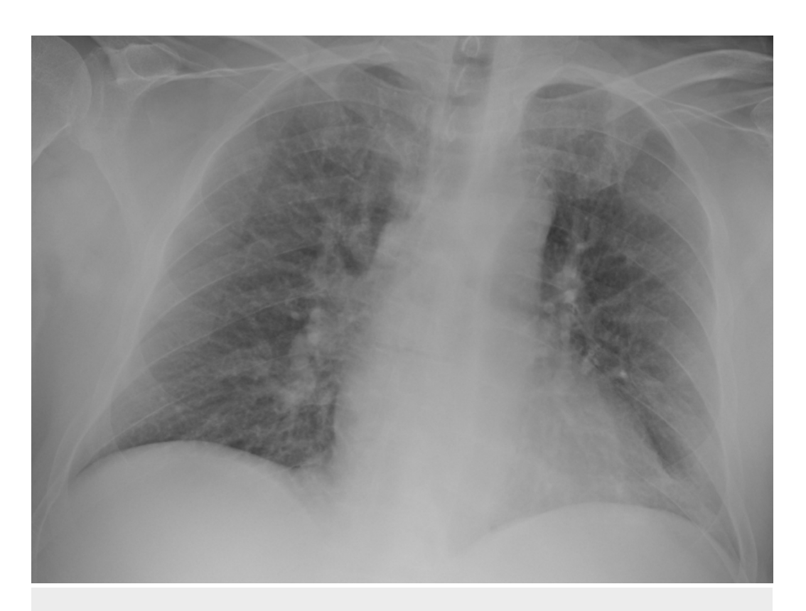
FIGURE 1: X-ray of the Chest (coronal view)