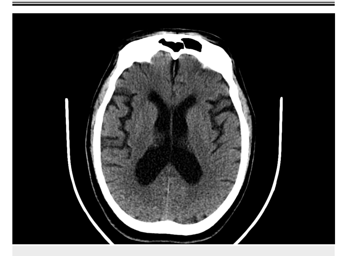
FIGURE 3: Computed Tomography of the Brain Without Contrast (axial view)

Leftwards facing red arrow shows the emphysematous changes.